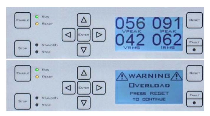
7794 Front-Panel Display and Controls