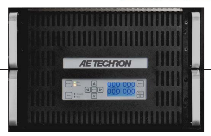
7794 4-Quadrant Power Amplifier / Battery Simulator